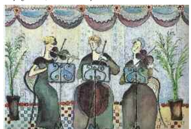
"Trio" by Lyn White